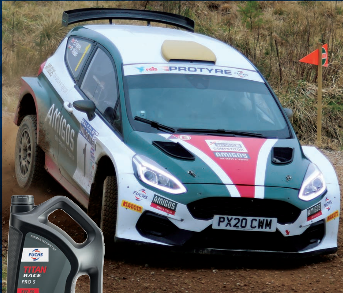
Engine Oil FUCHS TITAN RACE PRO S 5W-30

As used by 2024 FUCHS LUBRICANTS BTRDA Gold Star Champion Elliott Payne - Pictured